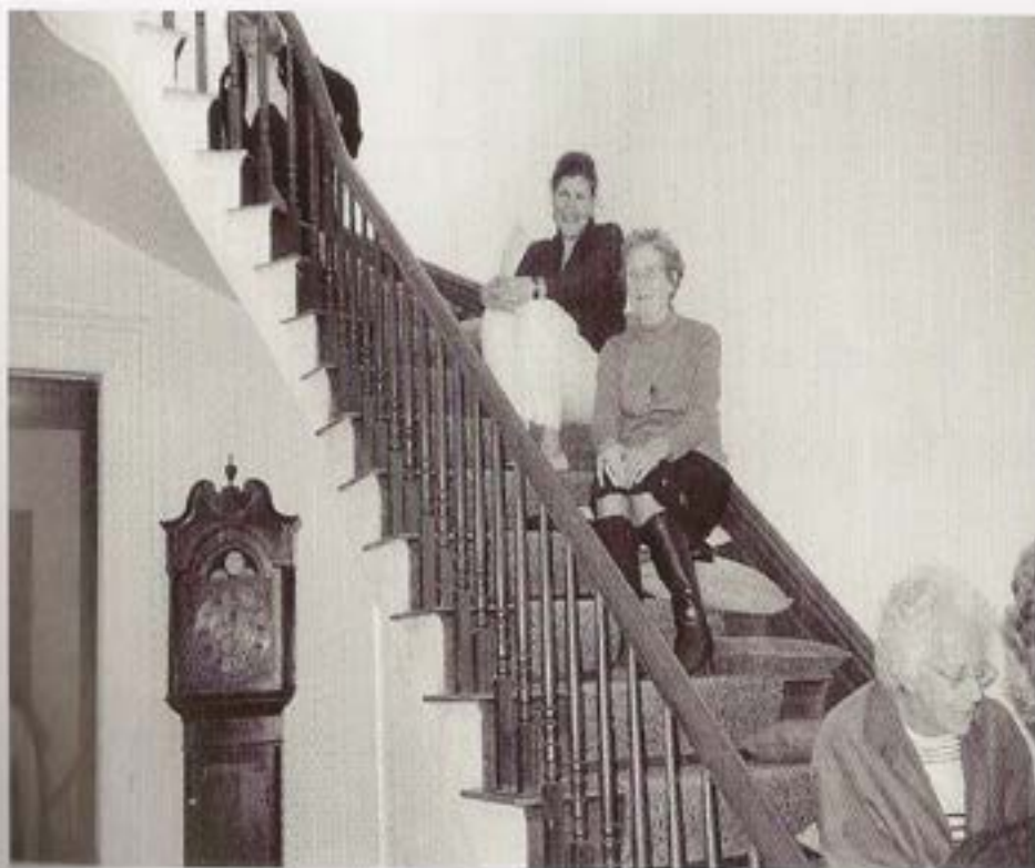
Classical music devotees sit on the front staircase to hear Beethoven piano sonatas performed by young artists from the N.C. School of the Arts.